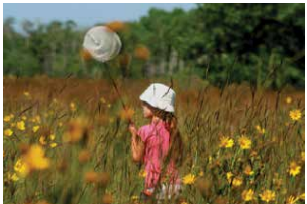
TALL GRASS PRAIRIE PRESERVE, MB